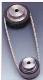
SINGLE SIDED BELT